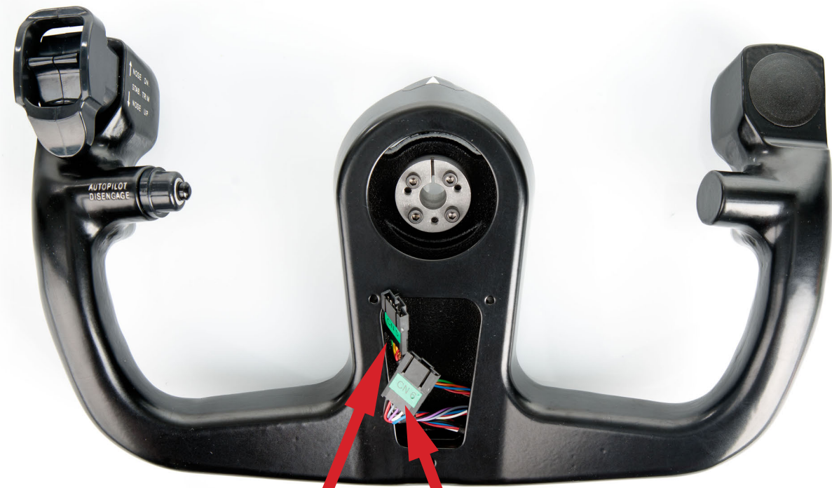
FSC 737NG Yoke Wheel PRO CPT (SKU: 194713)