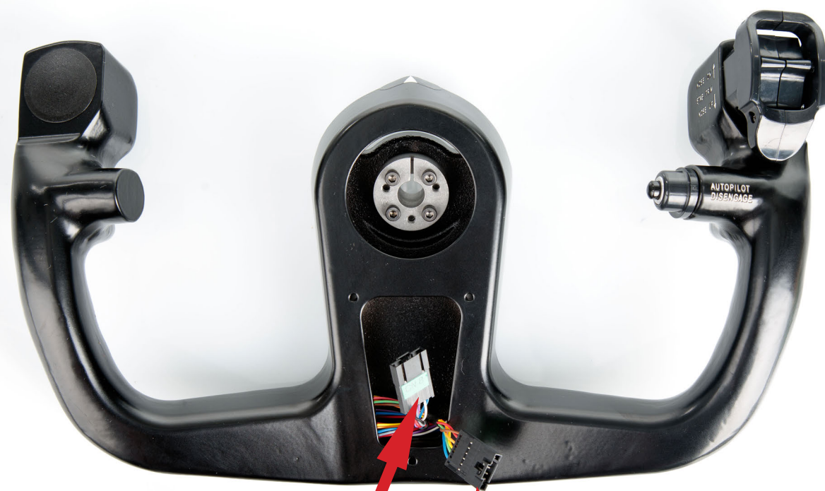
FSC 737NG Yoke Wheel PRO F/O (SKU: 194714)